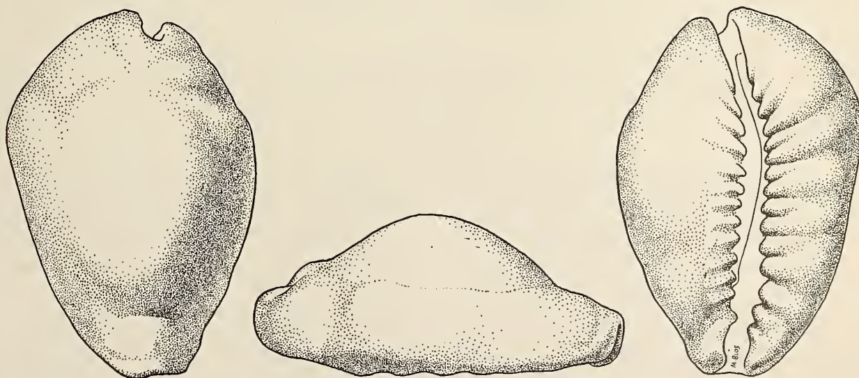
Figure 2. Cypraea moneta Linnaeus. Hypotype 37727, Univ. Calif. Mus. Paleon. Type Coll., Loc. B-6098. Clipperton Lagoon, dead. x 2